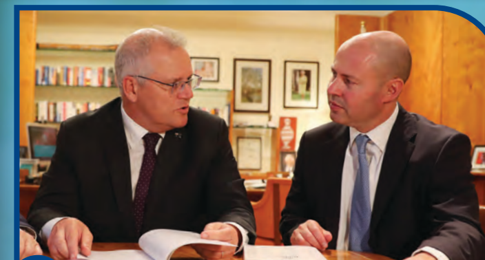
Paul Fletcher MP Federal Member for Bradfield